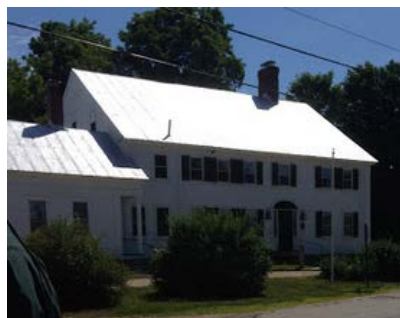
Captain Enoch Remick House

through six generations of Remicks, it had its share of additions and style influences. There were artifacts and structural details from each era and our tour guide did a fantastic job bringing each room to life.